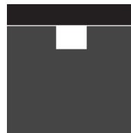
C5 Direct 5in x 3.5in